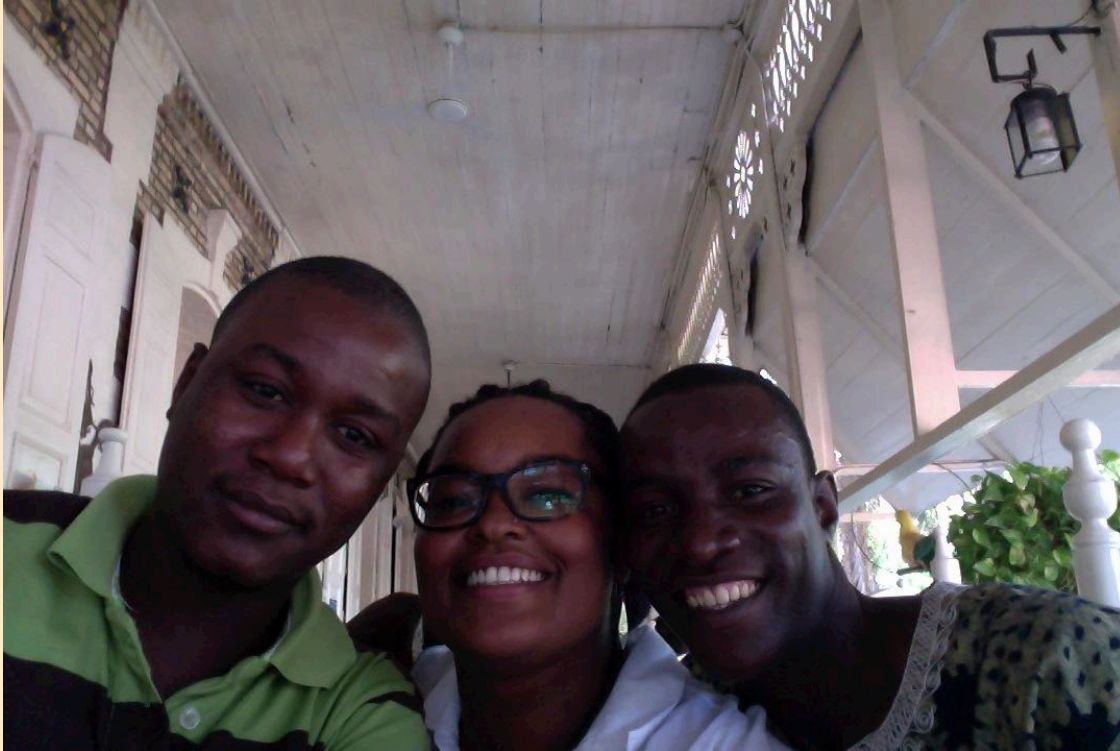
Founding members of the group KOURAJ