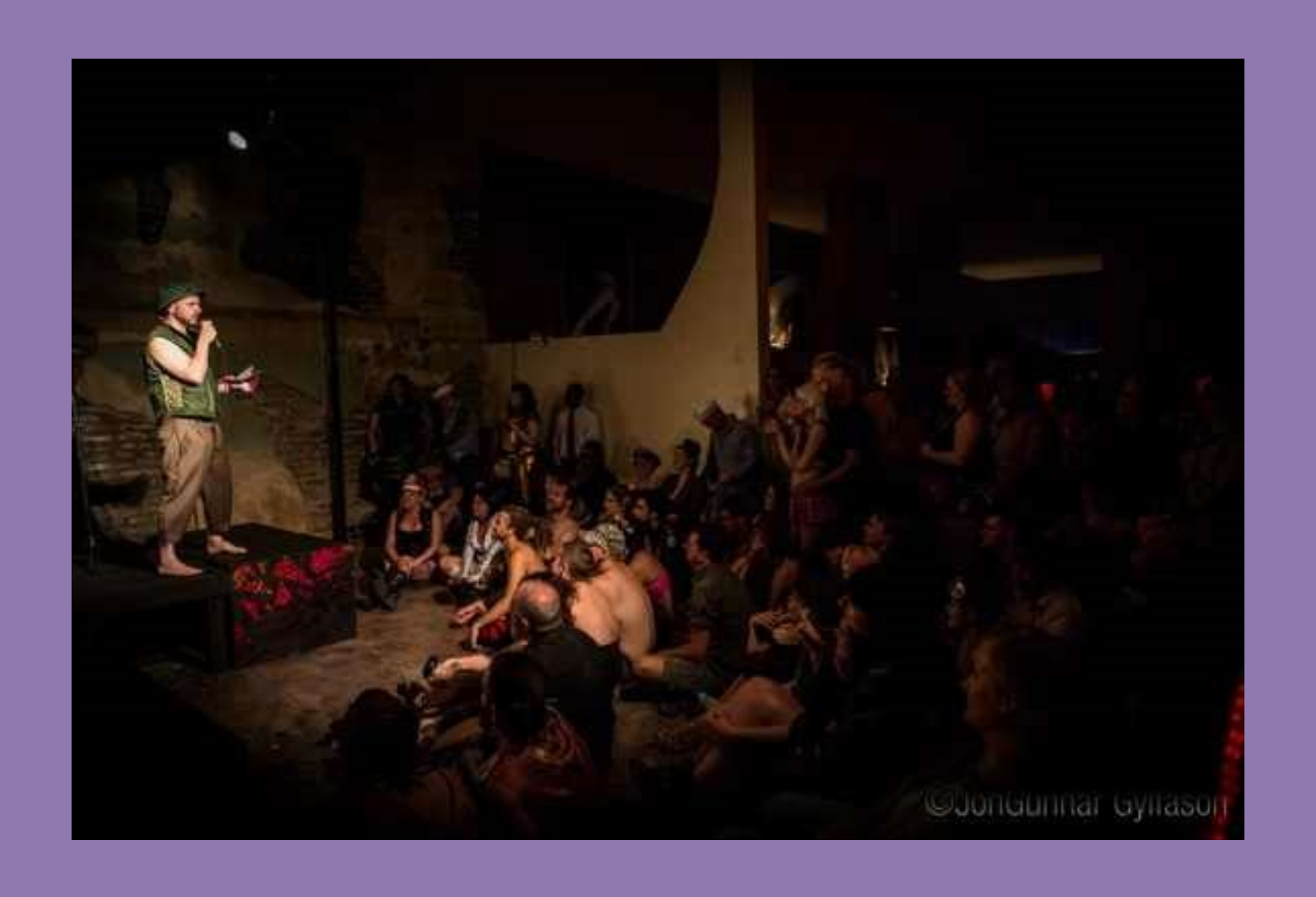
An Adventure Awaits...